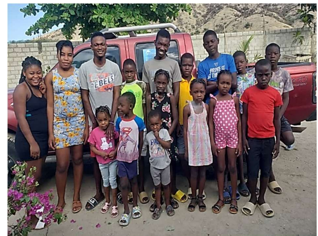
The kids in our children's home shown with the truck.

Yikes our mission truck engine broke down on the way to get all the food but thankfully was repairable. Esdras and a group of men travel very far for better prices and there's always danger of gangs taking everything or worse . The mission truck literally saves lives over & over.